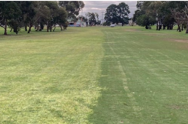
Poa annua control: Untreated vs Treated with BARRICADE® @ 3 L/ha

With the extensive rainfall experienced in recent times across Australia, it may have disrupted set plans for the autumn application of BARRICADE® Herbicide for pre-emergent control of Winter Grass ( Poa annua ). If you have been delayed and Winter Grass has started to emerge, then a tank mix combination of BARRICADE® and MONUMENT® Herbicide will get your season back on track.